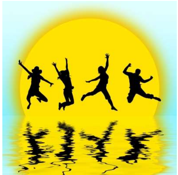
Jump for Joy: “The Pursuit of True Happiness”