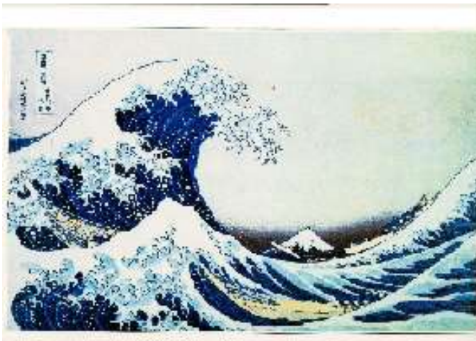
Hokusai's vision of the flood

The Japan Flood Friendship Fund (JFFF) has been established by the US-Japan Council (USJC) and others to aid those affected by Japan's current weather disaster. Ehime, Hiroshima and Okayama prefectures have experienced floods, landslides, hundreds of deaths, home damage and lack of drinking water.