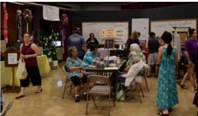
Cultural exhibits and crafts – something for everyone.